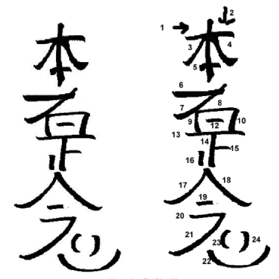
Hon sha Ze Sho Nen

Please note the number 11 is missing as it looks like part of the drawing!