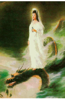
Symbols for Level One Violet Flame Reiki

It will be necessary to practice this mantra unless you already use it in your spiritual work or are familiar with sanskrit pronunciation.