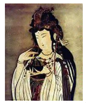
Symbols for Level Two Violet Flame Reiki